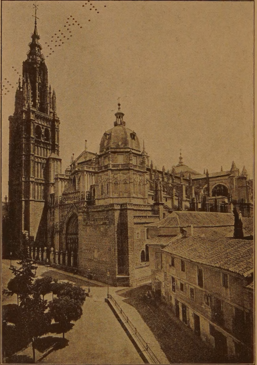
THE CATHEDRAL, TOLEDO